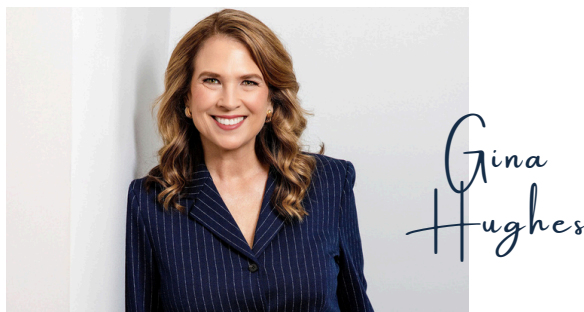
Owner and Senior Financial Advisor

We believe in providing full transparency and clear, upfront language about our fees and compensation model. We update our clients regularly, sharing our market insights and investment strategies so that you always understand the reasoning behind decisions. Our model is directly aligned with your success, so we succeed when you succeed.